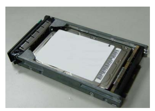
Figure 6: Finished assembly of the 2.5" Drive Carrier

An image of the finished 2.5" drive carrier assembly with AXXTM3SATA board and bracket is shown in Figure 6.