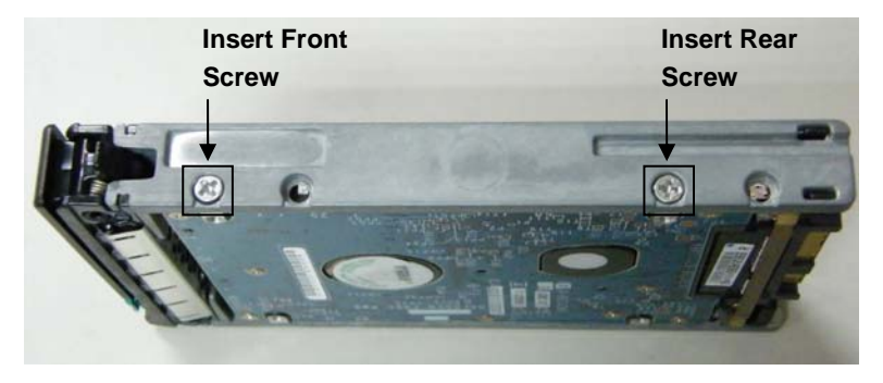
Figure 5: Insert screws into 2.5" Drive Carrier holes

5. To secure the hard drive and AXXTM3SATA assembly to the drive carrier insert the four screws (removed in step 2 above) as shown in Figure 5. When inserting the front and rear screws on each side of the drive carrier select the hole positioned towards the front of the drive carrier.